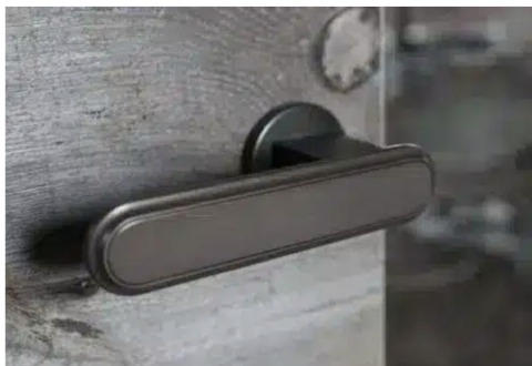
Oblò, the design handle by Razeto & Casareto, was awarded with the Liguria International Award

Two Honourable Mentions were also awarded by the Jury of the Design Innovation Award 2023: one to Northern Light Srl for the ECORACER 30 ONE DESIGN for demonstrating what it means to take a prototype and move it into industrial production, using experimental techniques and sustainable materials, and one to Mediterranean Yachts Srl for the VELJA 43 , a groundbreaking concept that reinvents the boat concept in a Mediterranean key.