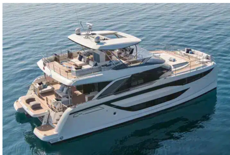
Prestige M8, winner in the Multihull category