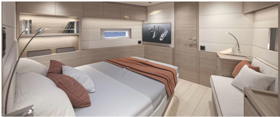
The owner's cabin boasts a walkaround French bed – unusual on a 60-footer.