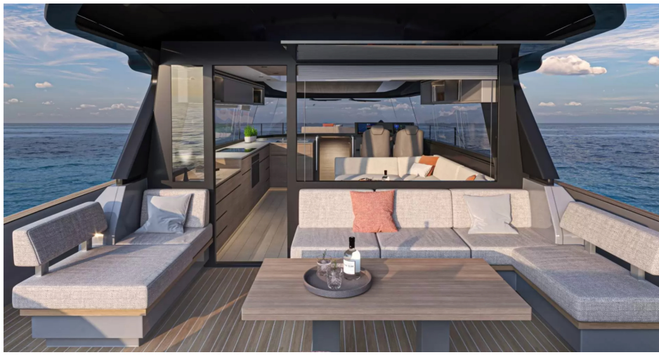
Whether on deck or inside, expansive windows and retractable doors offer panoramic views.