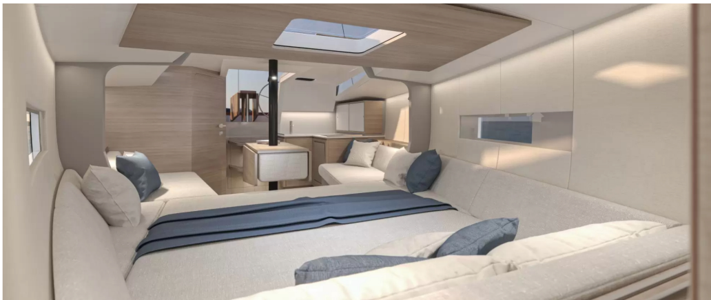
The Grand Soleil Blue project is a 10-metre sailing boat with interior and exterior design from Nauta.